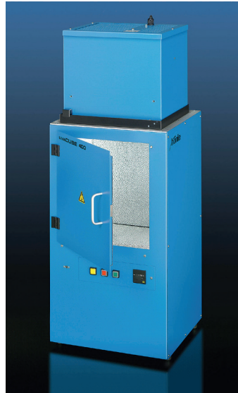
Sun simulation chamber UVACUBE 400

Alternative filters are available which can vary the spectrum to suit users needs.