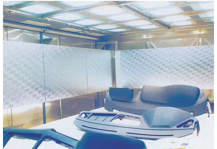
Climatic chamber with 24 SOL 1200

Beside conventional ballasts you can also use electronic power supplies (EPS) made by Hönle. These EPS supply the lamp with a rectangular current that improves the performance of the luminous flux. Thus, the power output increases by approx. 10%.