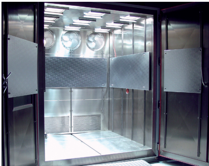
Climatic chamber with 9 SOL 2000 units

Special metal halide bulbs produce the light spectrum. Metal halides hermetically sealed inside the bulb are vaporised by an electric arc and generate a spectrum, which is close to that of natural sunlight. SOL units do not produce ozone .