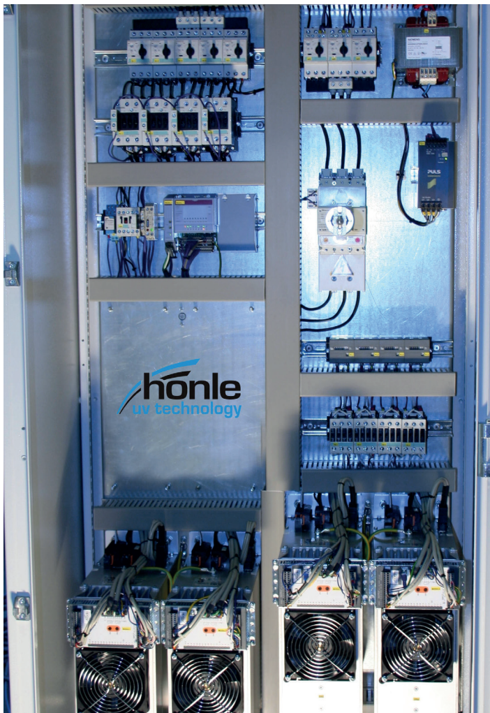
Sun simulation switch cabinet

The high efficiency and long lifetime of the Hönle metal halide bulbs makes solar simulation with SOL units economically attractive. They can be integrated into climate test cabinets and chambers as well. Thus, multi-parametric tests can be done. The units can be fixed outside the climate chamber and radiate through high-grade filter glass into the testing room. High quality filter glass protects the SOL units from humidity and temperatures from inside the chamber, and avoids undesirable interaction between the bulbs and external contaminants. By simply adding another glass filter, outdoor irradiation can be changed to indoor irradiation (or vice versa).